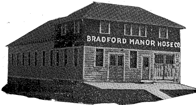
Bradford Manor Hose Co. No. 5 Momauguin