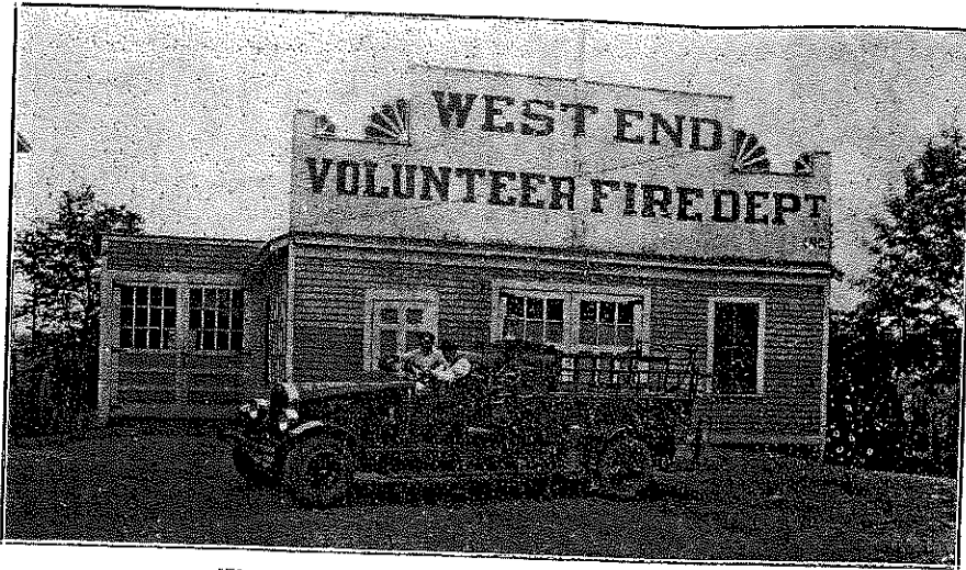
West End Fire Co. No. 3 Main Street

—VE East Haven — fire dept copies — main st. momauguin