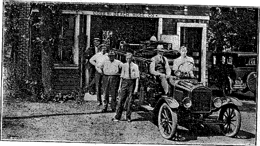
Cosey Beach Hose Co. No. 2 Momauguin