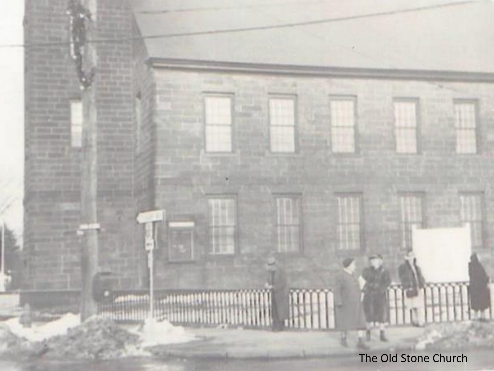
The Old Stone Church