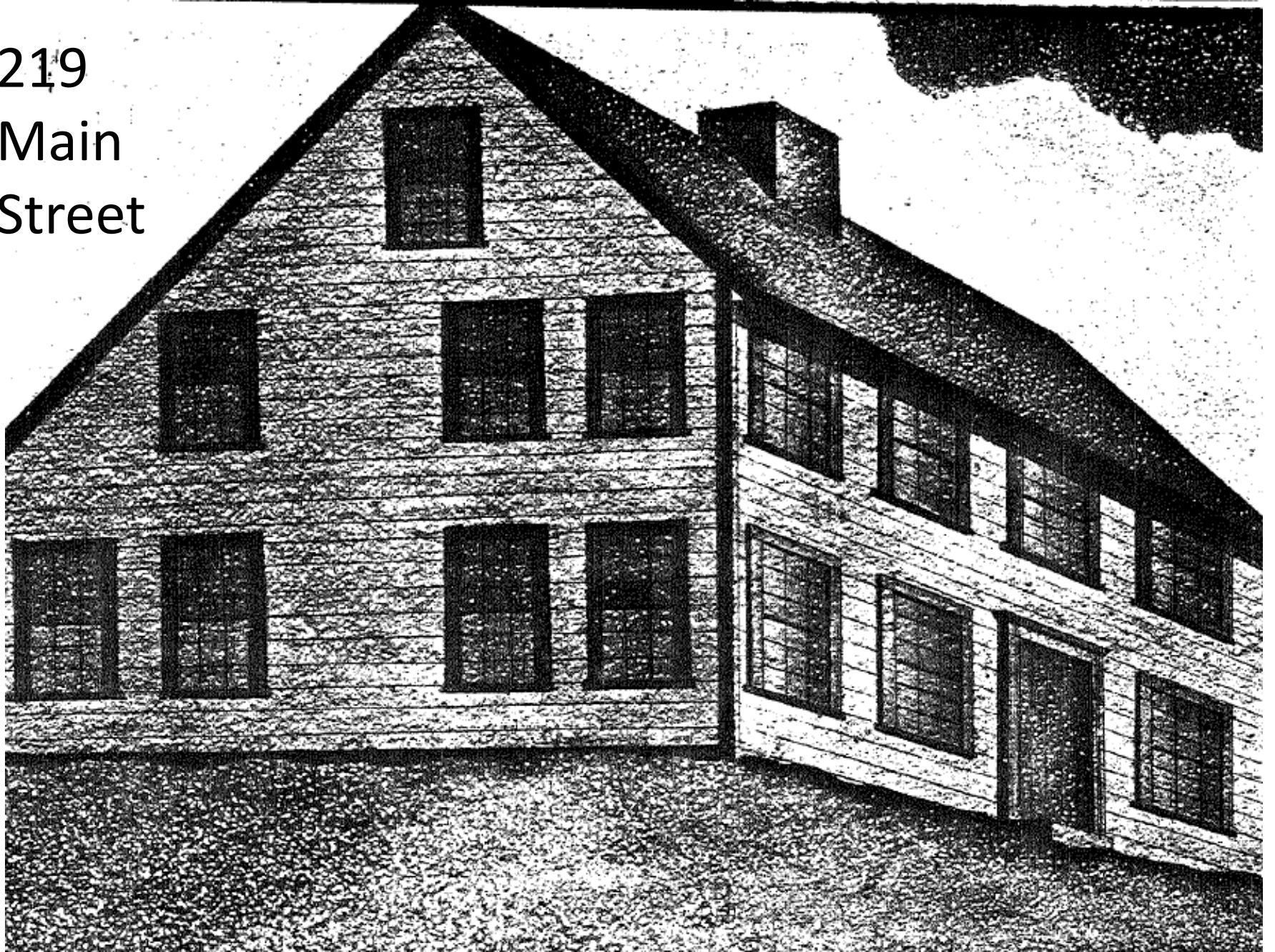
The old Hagaman House on Main Street