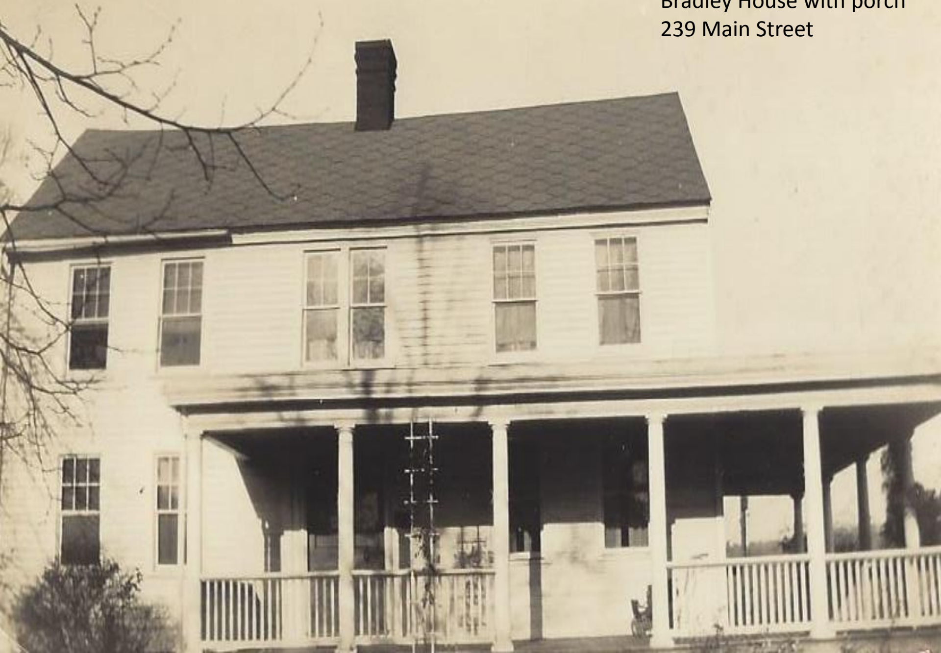
Bradley House with porch 239 Main Street