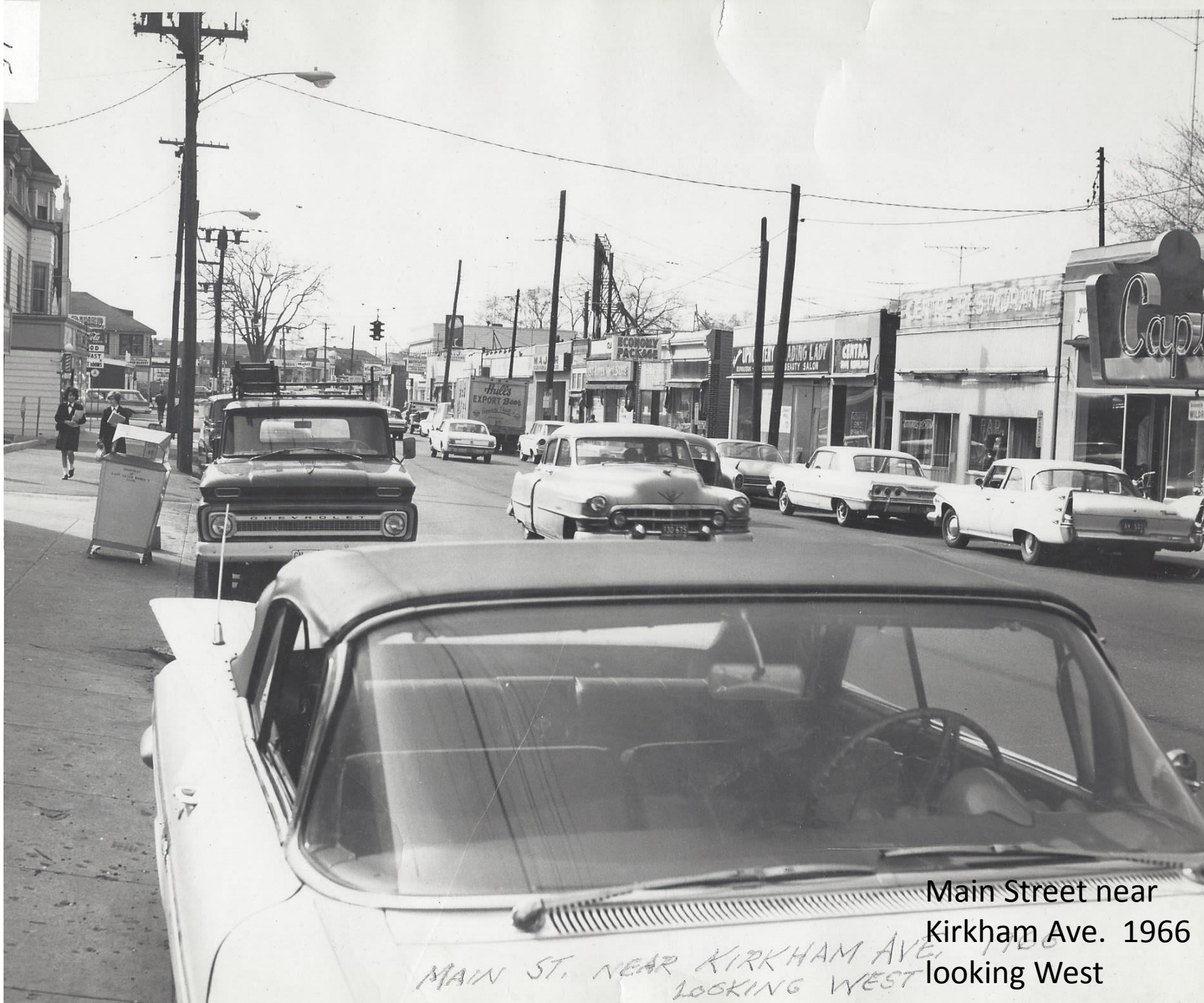
Main Street near Kirkham Ave. 1966 looking West