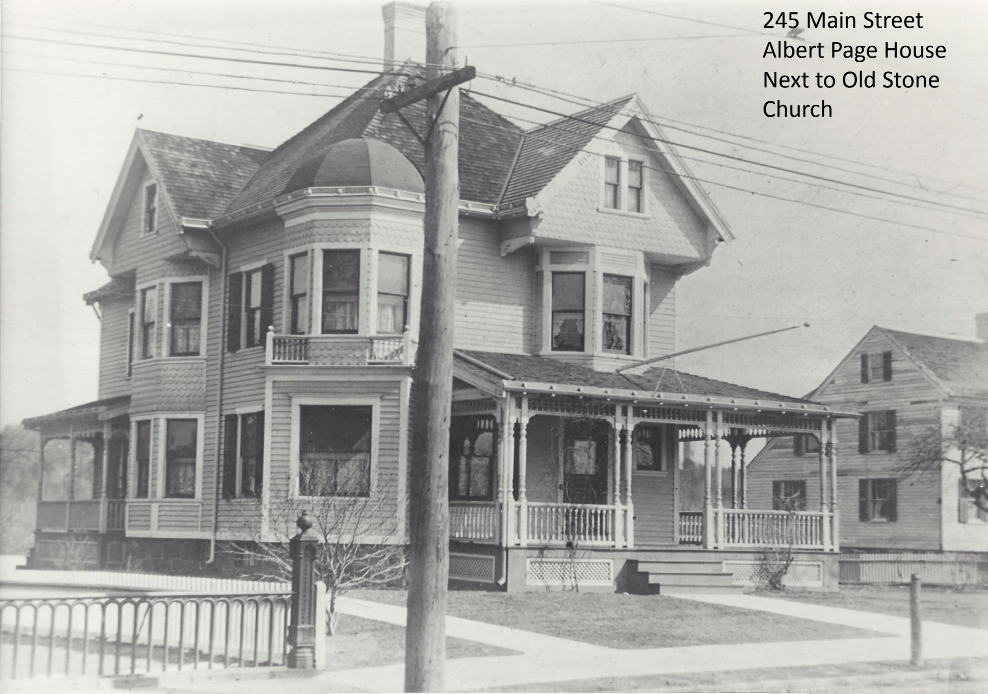
ALBERT PAGE HOUSE NEXT TO OLD STONE CHURCH 245 MAIN ST EAST HAVEN CONN r BRADLEY TAVERN

245 Main Street Albert Page House Next to Old Stone Church