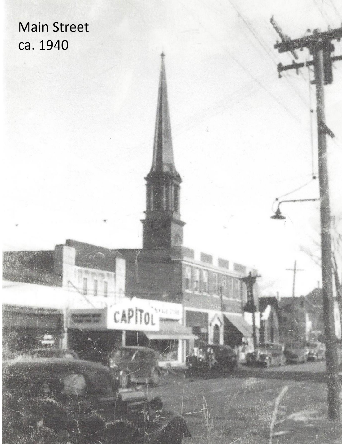
Main Street ca. 1940