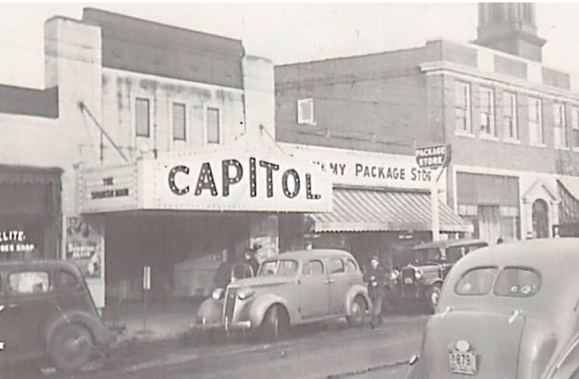
271 Main Street Capitol Theater