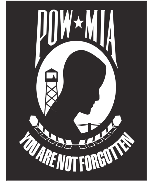
Above: POW-MIA Poster