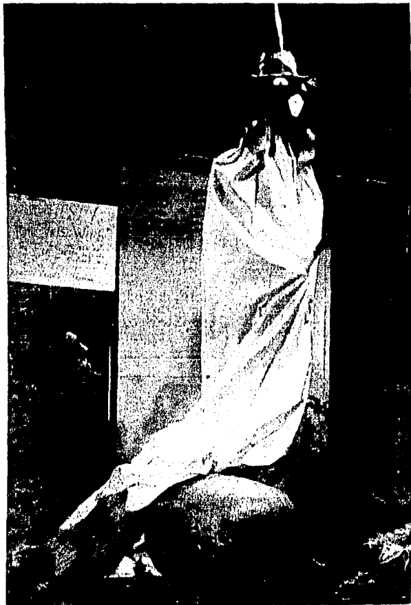
—Lucas Studio Dress? People? Come on! More than 500 entries have been made in the "Name The Witch" contest sponsored by East Haven...