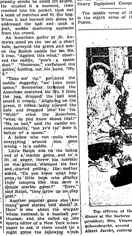
Woman's Club Officers