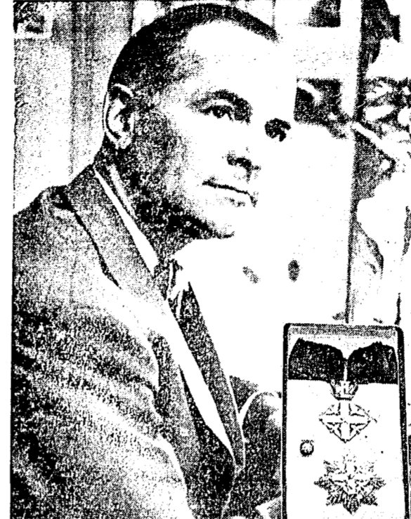
Governor John Davis Lodge will be honored by Italian-Americans of Connecticut at the Waverly Inn, Cheshire, June 14. The affair will honor the Governor on his recent acceptance of the high Italian Government award of "Degree of Grand Officer of the Order of the Republic." The above photo shows the decoration (insert), which is one of the highest that the Italian Government bestows.