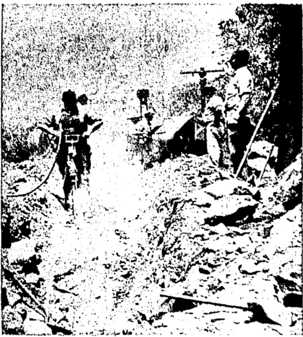
A workman of the New Haven Water Company looks up from his job of drilling through solid rock in preparation for the blasting of a trench for a water pipe line to the new school in Mohegan. Approximately 100 feet of pipe already have been laid and covered over.