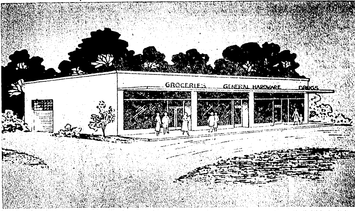
Shown above is a sketch of the type of building that Mauro Con struction Co. plans to erect on a site on North High St., if its application for a rezoning the area to business is granted by the Z oning Con