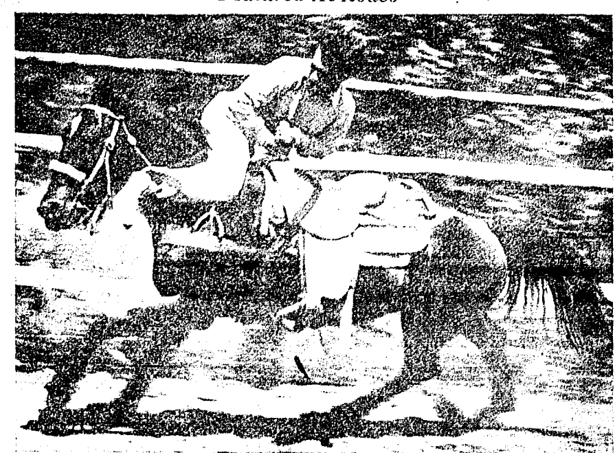
champion trick rider from Tulsa, Oklahoma, will be featured Sunday at the Rodeo to be shown locally under the sponsorship of the East Haven Lions Club.