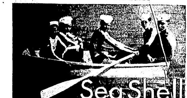
The Sea Shell, manufactured by Roberts Industries of Branford, is a complete kit of precision cut wood and plywood parts easy to put together.