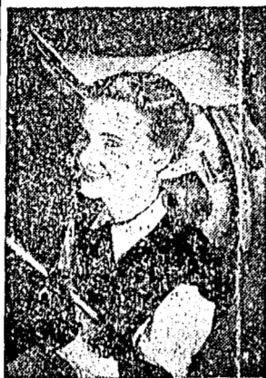
from your face, so it will not interfere with your fast tennis strokes or your control of a horse—and it makes you look pretty as a picture.

School days are carefree days—but get a school-girl to admit it! Though exams can't be classified as carefree, don't forget the parties, sports and dating (now that the war's over) which are just as much part of school days as study! Part of the fun of going to school is dressing the part for school activities as they come along. The way your hair looks is one of the big points in "looking a part!" You wouldn't dream of dating for a dance with the same carefree (or is it careless?) hairdo you wear to class. You wouldn't be caught in the canteen in the same hairdo you rate perfect for after-hour "jam" sessions. Or, would you? One essential to "looking the part" for every activity doesn't change—hair must be clean and shining. Luckily, this is a look and a state that's easily achieved by regular use of a liquid conditioning shampoo.