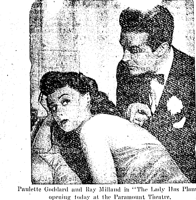
Paulette Goddard and Ray Milland in "The Lady Has Plans" opening today at the Paramount Theatre.