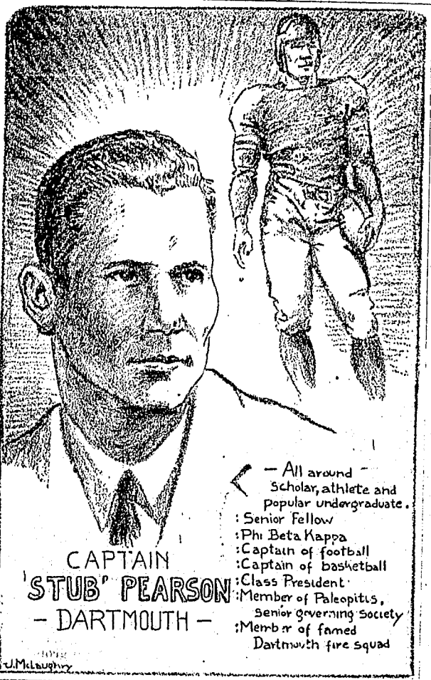
— All around — Scholar, athlete and popular undergraduate. — Senior Fellow. — Phi Beta Kappa. — Captain of football. — Captain of basketball. — Class President. — Member of Phi Kappa Phi. — Senior Ovington Society. — Member of famed Dartmouth five squad.