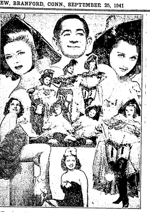
"Benevolence of 1942" a $4.30 musical revue at regular prices, featuring a cast of 60 with Willie Howard, in person, America's funniest comedian...

HOLLYWOOD GOSSIP Rosalind Russell, on the set of her new comedy, "Her Honor", playing hostess to a delegation of postmen from her home town.