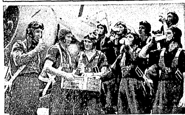
Army fliers at Randolph Field, Texas, are daily milk drinkers.

NEW YORK—U. S. soldiers in the vast army maneuvers now under way will fight their penicillin battles with fresh milk in their daily diet.