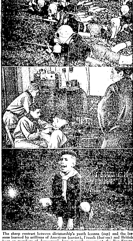
The sharp contrast between dictatorship's youth lessons (top) and the les-tions learned by millions of American (center), Irench (bottom) and British lovys as members of democracy's largest youth movement, the Boy Scouts, is set in hold relief by . America," in the new March of Time-

vanilla. Sift flour once, measure, add baking powder and salt, and sift again. Add butter to chocolate and blend. Add gradually sugar to eggs, beating thoroughly; then chocolate mixture and blend. Add flour and mix well; then dates, nuts, and vanilla. Bake in two greased pans, $2322 inches, in moderate oven (350°F.) 35 minutes. Cut in squares before removing from pan. Makes 4 dozen Indians.