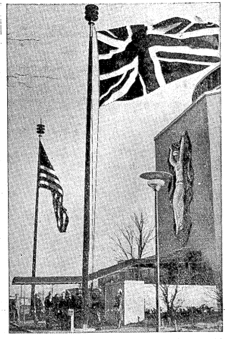
NEW YORK-A stirring scene in front of the Administration Building at the New York World's Fair 1939 as the Union Jack of Great Britain is hoisted aloft signifying that John Bull will be represented at America's exposition. The British exhibit will occupy 140,000 square feet, the largest of the 64 foreign displays now being prepared, and will cost several millions.